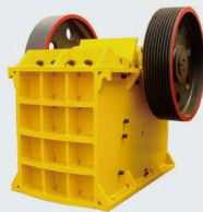
重载荷+冲击负荷 Heavy load + Impact load

Application: jaw crusher, roller crusher, hammer crusher, impact crusher and other crushing machine with impact load