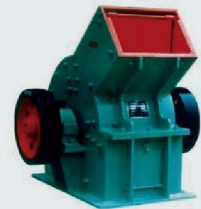
轻载荷+高速旋转 Light load + High speed rotation