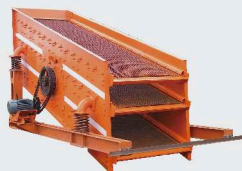
重载荷+高速旋转 High load + High speed rotation

Application: high speed, heavy load, high impact vibration machine