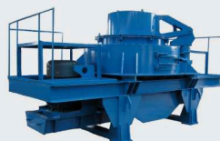
轻载荷+高速旋转 Light load + High speed rotation

Application: high speed and light load condition