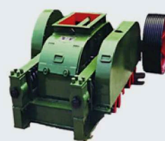
重载荷+低速旋转 Heavy load + Low speed rotation